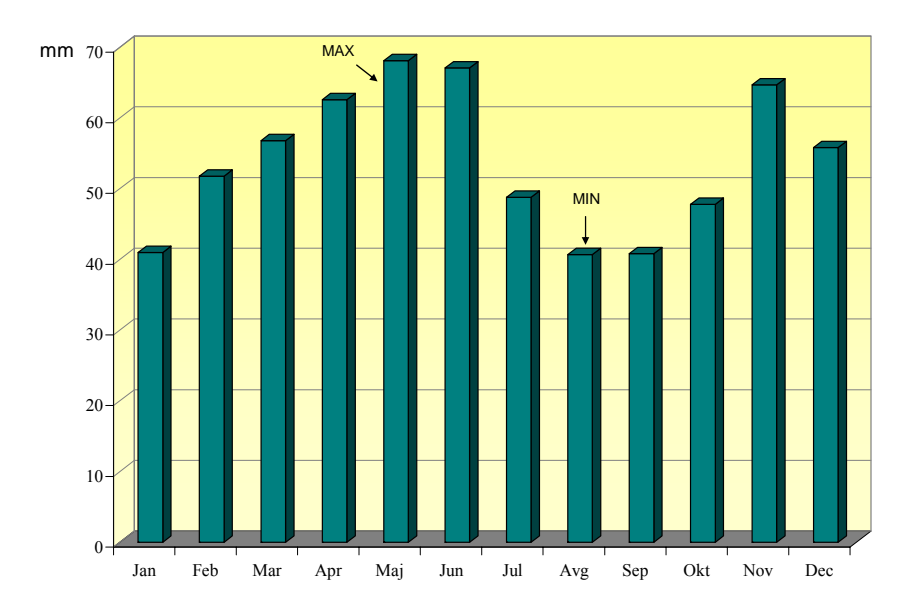
Figure 1. Annual changes in average precipitation quantities, Palić